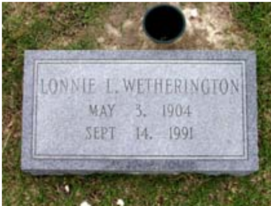
23. Lonnie L. Wetherington May 3, 1904 – September 14, 1991