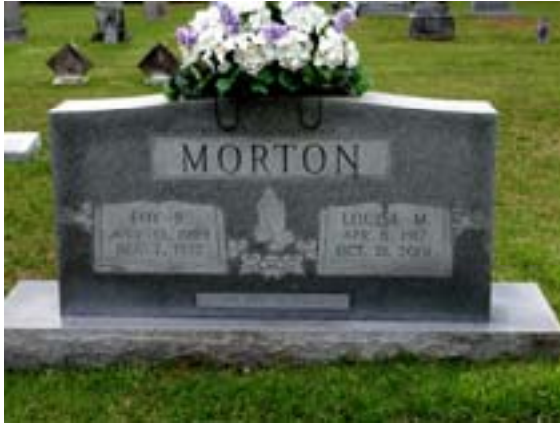
21. Foy R. Morton July 13, 1909 – December 7, 1972 Louise M. Morton April 8, 1912 – October 21, 2001