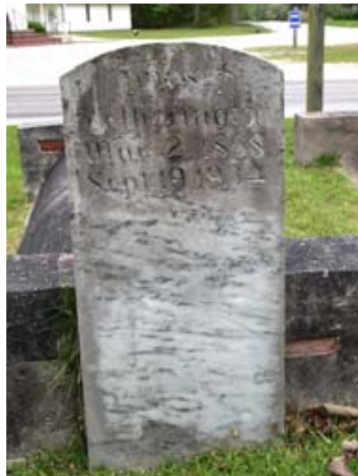
4. Amos T. Wetherington March 2, 1868 – September 19, 1934