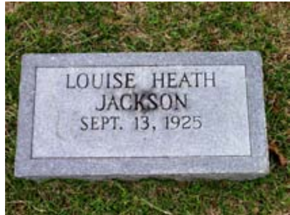
30. Louise Heath Jackson September 13, 1925 -