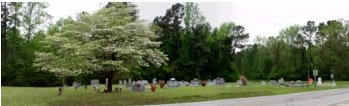
Figure 2 The Gethsemane Free Will Baptist Church Cemetery

In addition to an index, detailed information is listed under references.