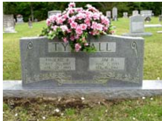
8. Phoebe Tyndall July 26, 1897 – February 27, 1993 Jim B. Tyndall June 7, 1893 – February 10, 1961