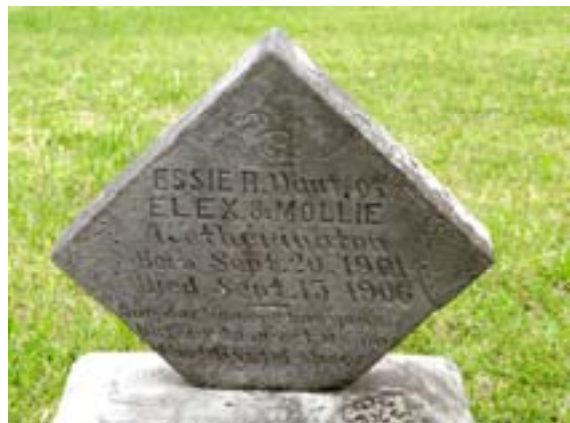
40. Essie R. Wetherington daughter of Elex & Mollie Wetherington September 20, 1901 - September 15, 1906