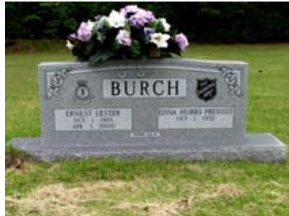
42. Ernest Lester Burch October 1, 1928 – April 1, 2000 Edna Hobbs Prevost Burch October 1, 1932 -