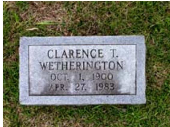
6. Clarence T. Wetherington October 1, 1900 – April 27, 1983